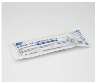
Vorderansicht 1er Softpack